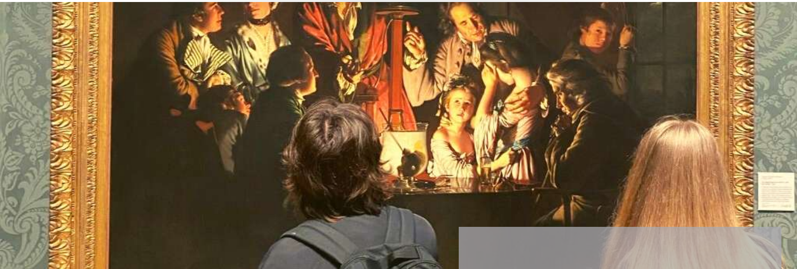
Students at the National Gallery & Pineapple Studios