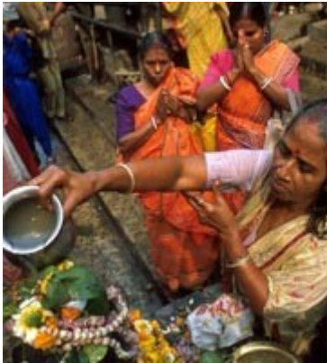
Indian women worshipping Shiva on the Ganges

It's an undertaking to see and be seen by the deity.